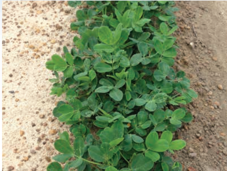
On the left are CruiserMaxx® treated peanuts and on the right are peanuts treated with THIMET®. Both plots feature the 06G cultivar and were planted on May 1, 2013. Photo was taken at a University of Georgia plot on June 11, 2013 at the Gibbs Farm, Tifton, GA.