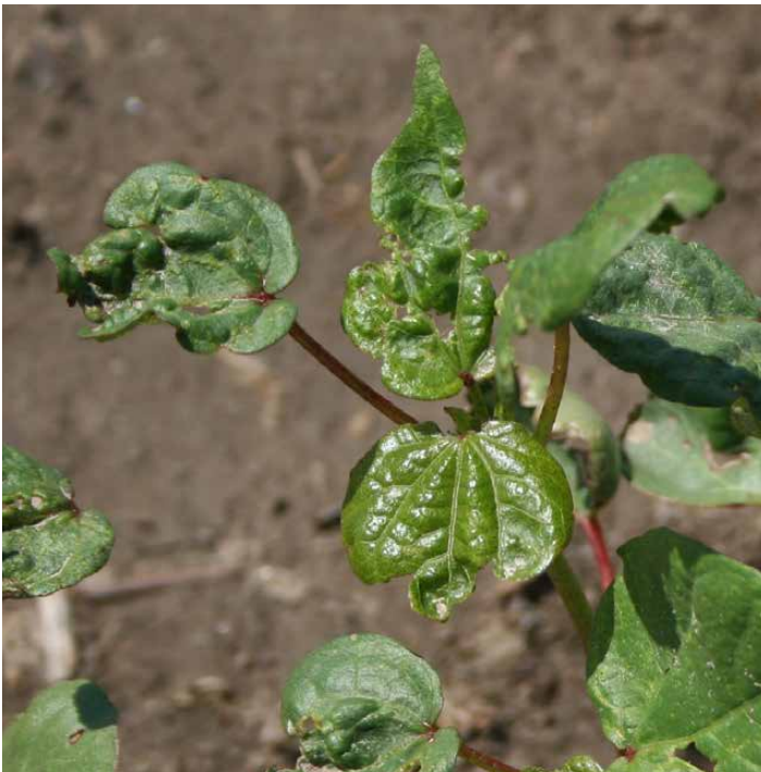
Typical crinkling and cupping of leaves caused by thrips damage.

Compared with other commercial combinations, Bidrin® provides better control of thrips, stink bugs, and tarnished plant bugs and equivalent control of fleahoppers giving growers the advantage of reducing damage and yield loss. Results from over 200 commercial field trials conducted from 2014-2017 demonstrate that Bidrin is a useful and effective tool for managing infestations in U.S. cotton. Choose Bidrin to deliver the critical control you need for strong stands and top yield potential.