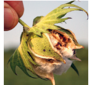
Internal damage under the boll wall — warts and yellow to dark brown stains on lint and seeds.