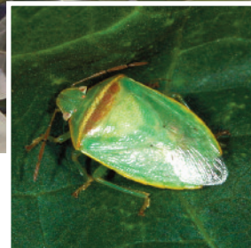
Red Banded Stink Bug Piezodorus guildinii