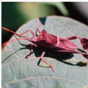
Leaffooted Bug Leptoglossus phyllopus