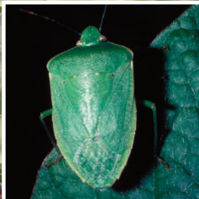
Southern Green Stink Bug Nezara viridula