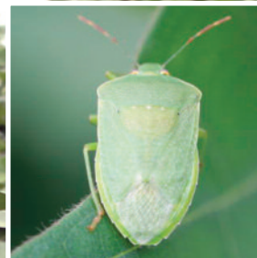
Green Stink Bug Acrosternum hilare