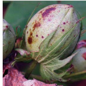
External damage is typically small, circular purple or dark depressions.

Stop stink bug damage to bolls, yields and fiber quality with Bidrin. Recent research confirms stink bugs are the predominant boll-feeding bugs in mid-season cotton. Stink bug feeding damage on cotton bolls has been shown to reduce cotton yields and lower HVI fiber quality. And relatively small population of stink bugs can cause major crop damage. Take control of stink bugs, regardless of species with the proven power of Bidrin.