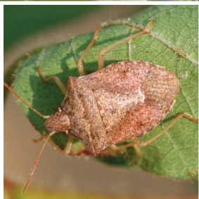
Brown Stink Bug Euschistus servus