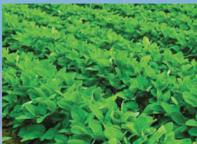
ACROPOLIS at 23 fl oz/A

Featuring two modes of action to prevent and arrest early infection in-plant, ACROPOLIS helps stop the establishment of white mold in soybeans. The consistency of performance and crop safety of ACROPOLIS has been excellent in 2017 research trials.